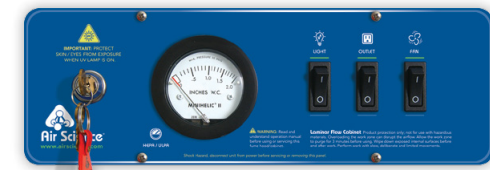
Control Panel Overlays