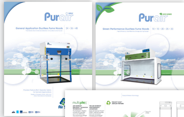
Product Branding and Literature